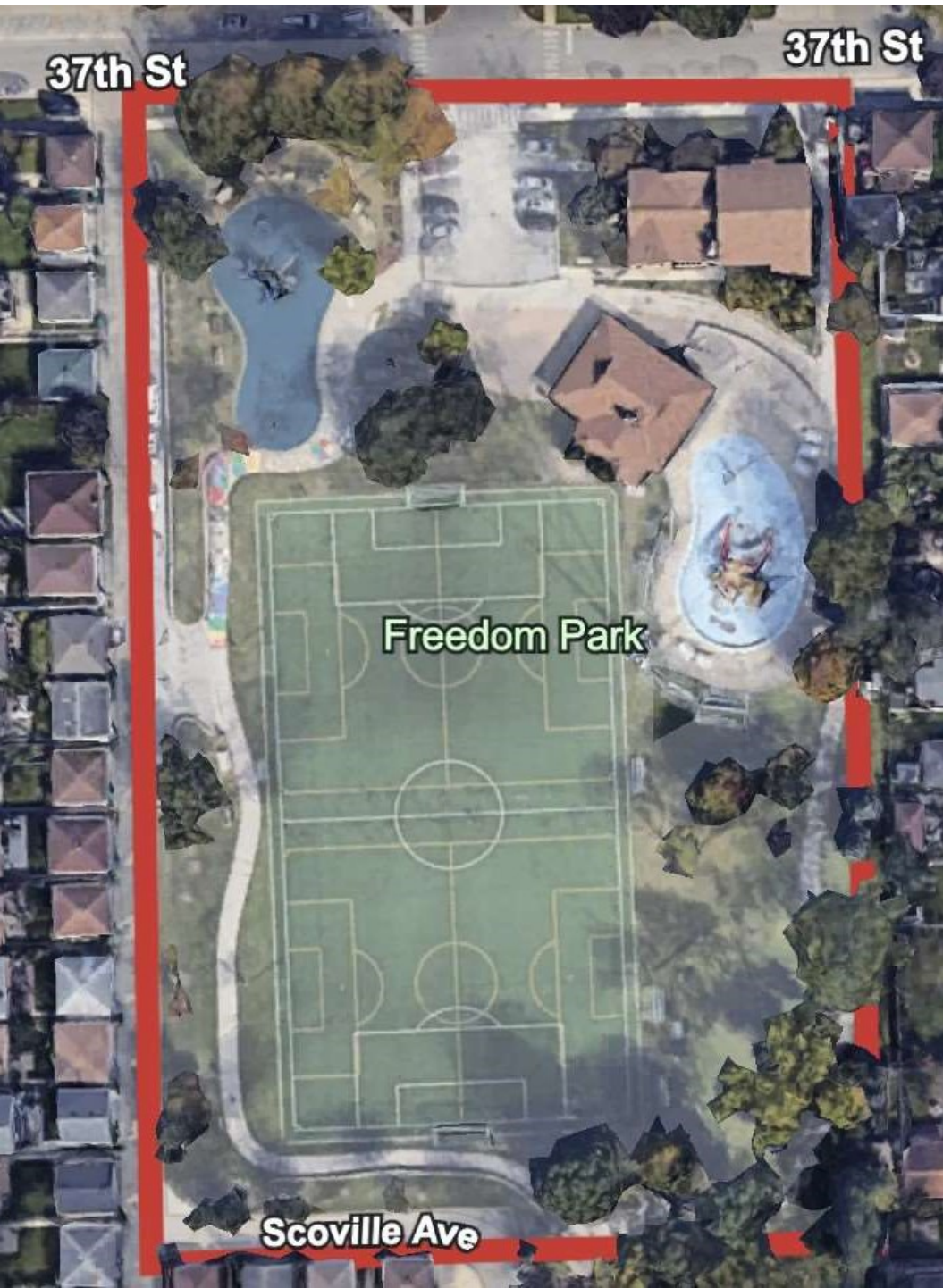
Freedom Park Mowing Boundary