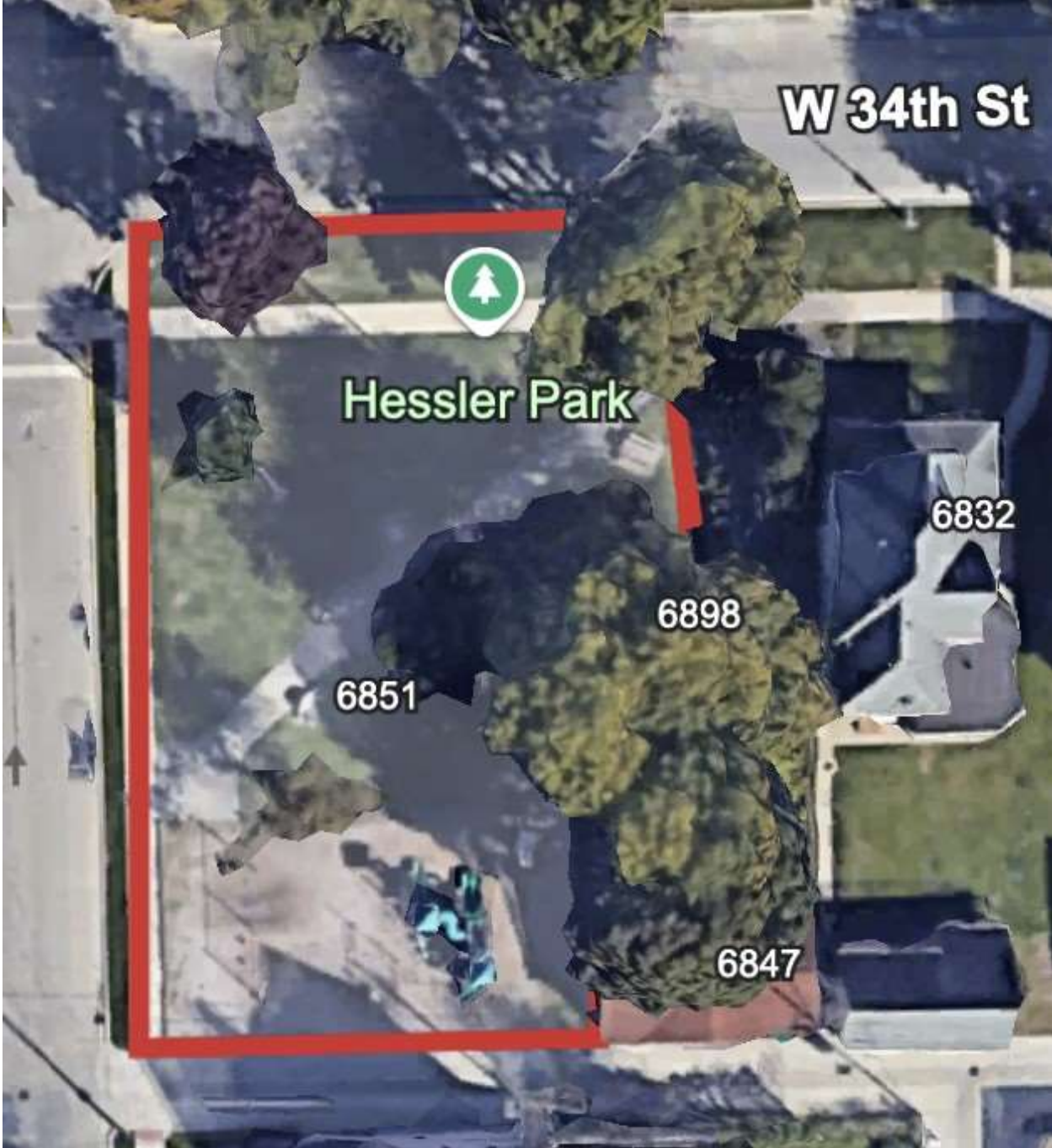
Hessler Park Mowing Boundary