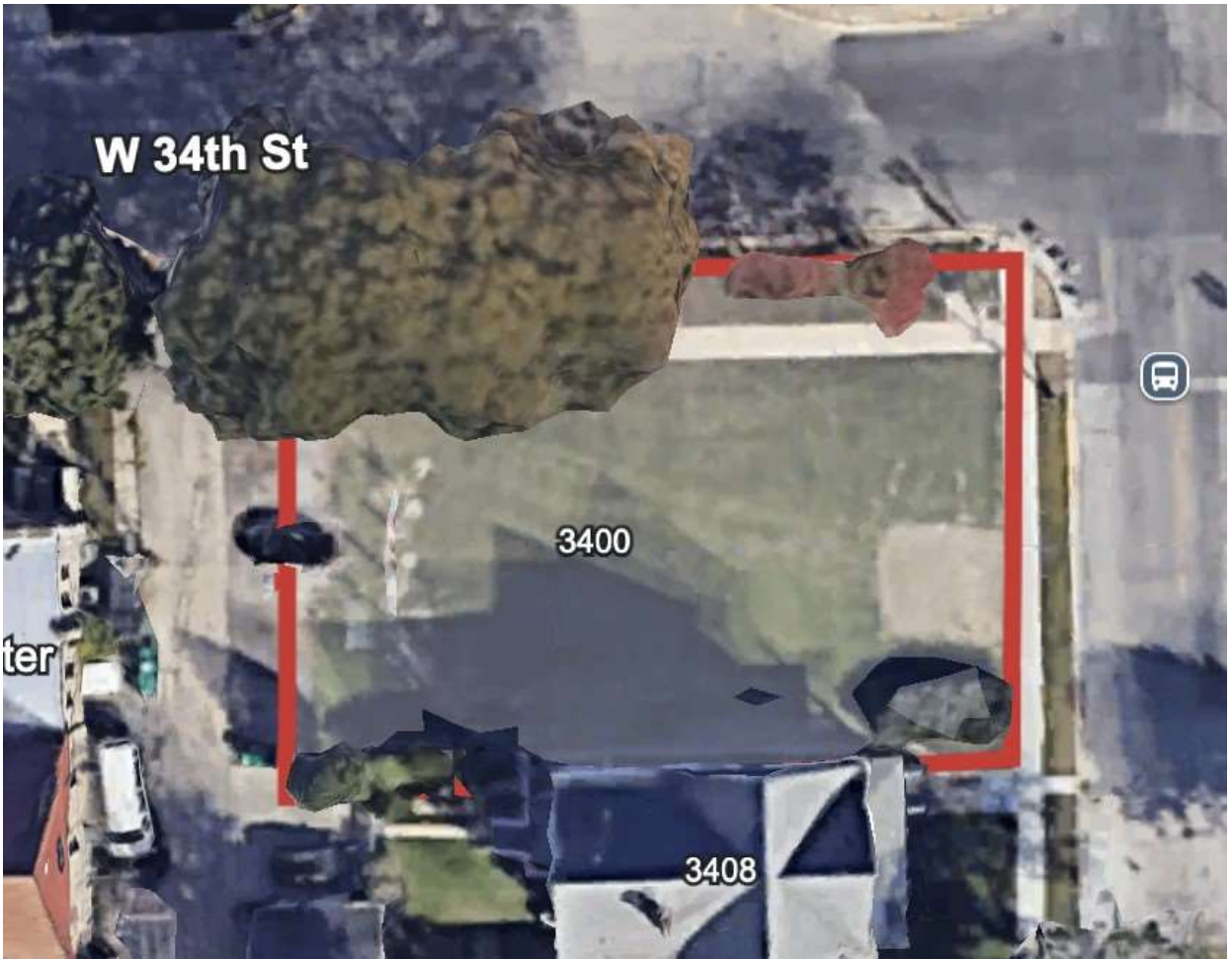
34th and Oak Park Ave. Mowing Boundary