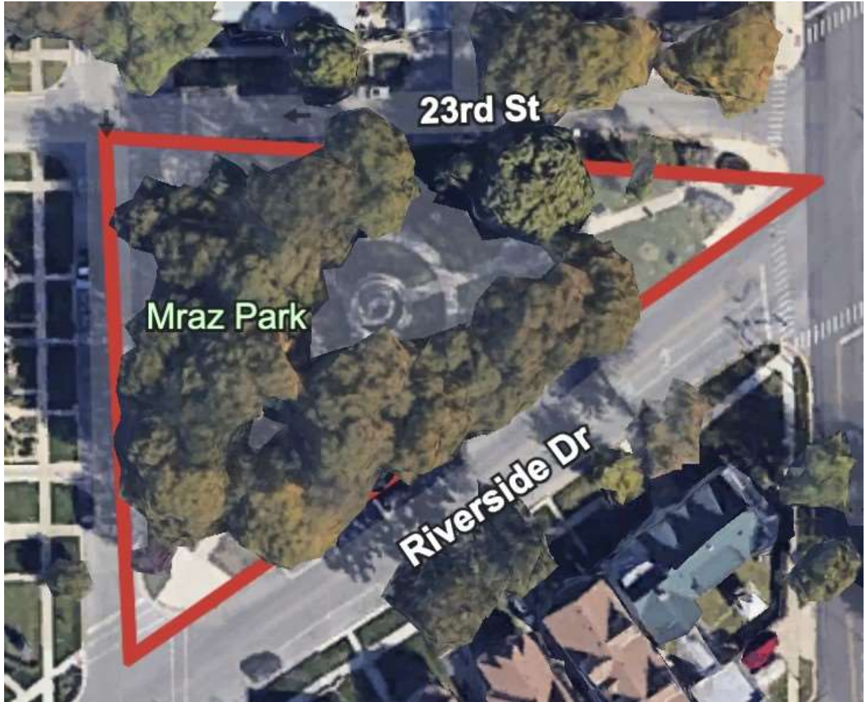
Mraz Park Mowing Boundary