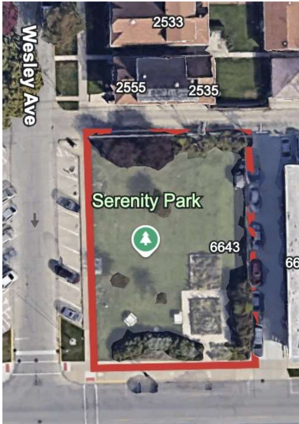
Serenity Park Mowing Boundary