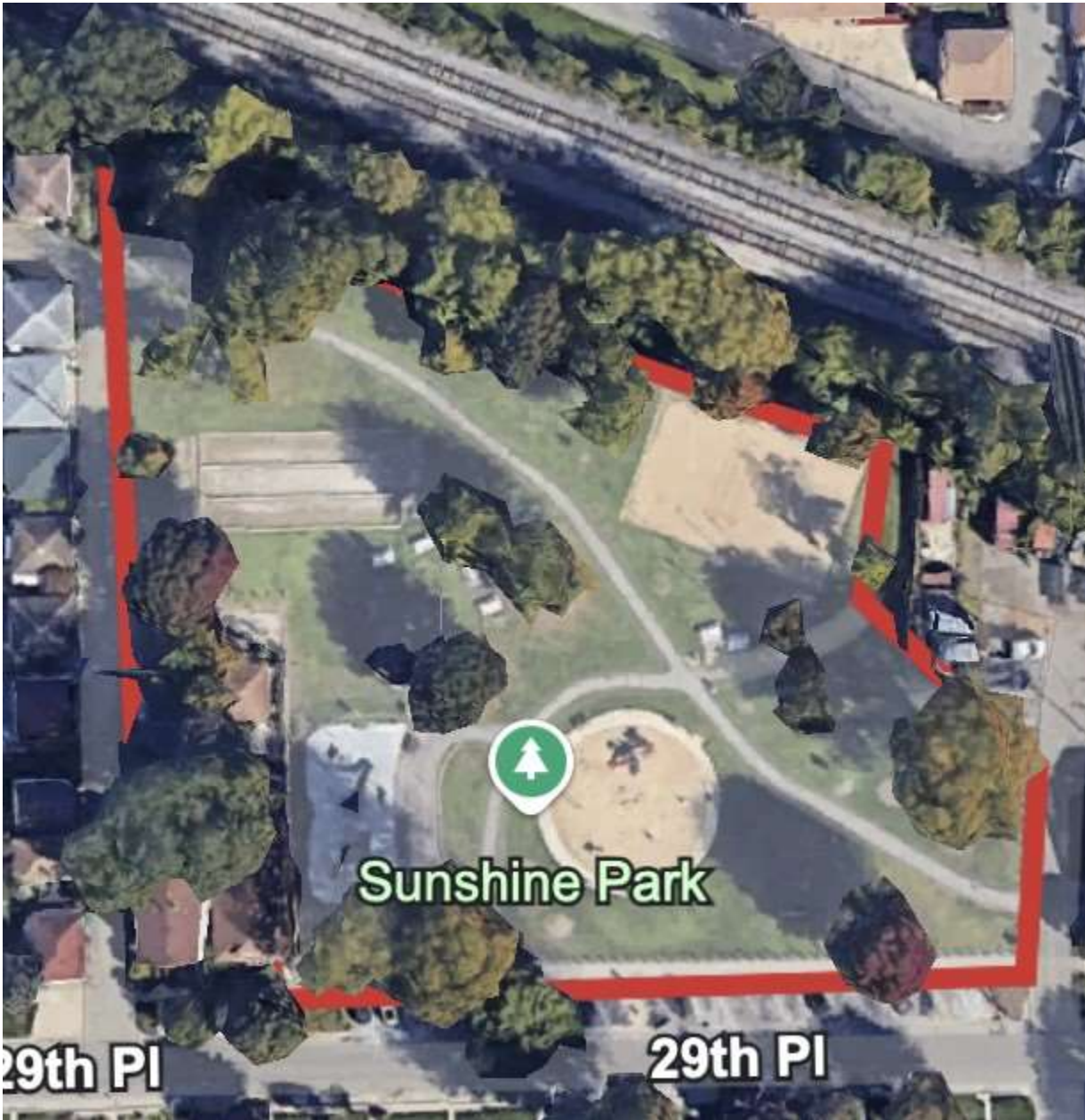
Sunshine Park Mowing Boundary