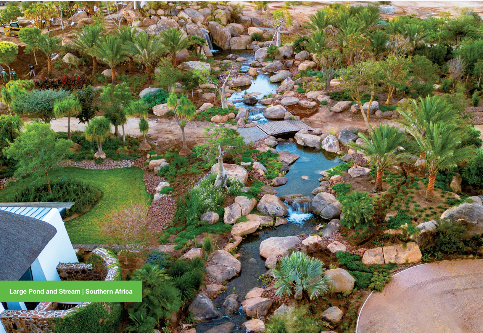
Large Pond and Stream | Southern Africa