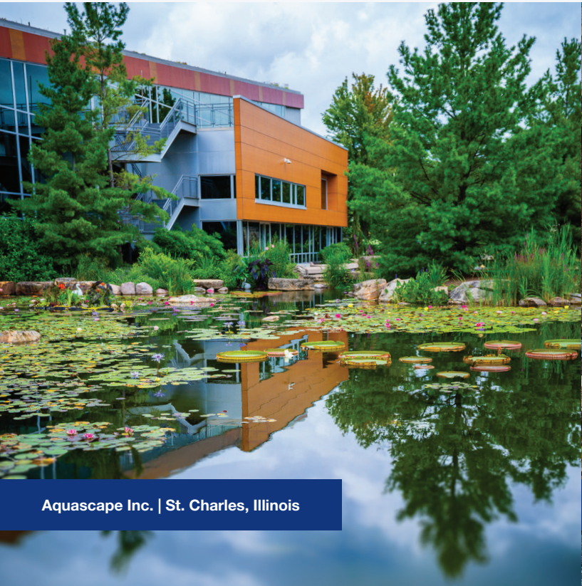
Aquascape Inc. | St. Charles, Illinois

Discover how you can start Living the Aquascape Lifestyle® today.