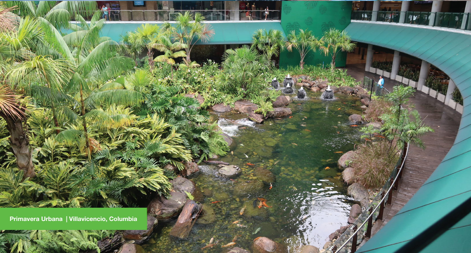
Primavera Urbana | Villavicencio, Columbia