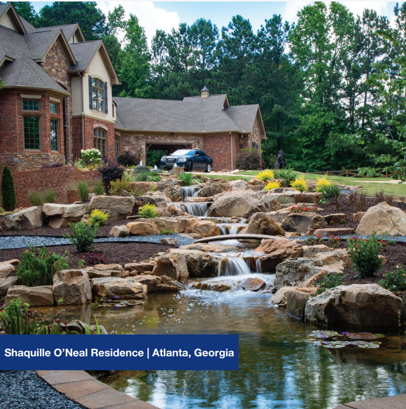
Shaquille O'Neal Residence | Atlanta, Georgia