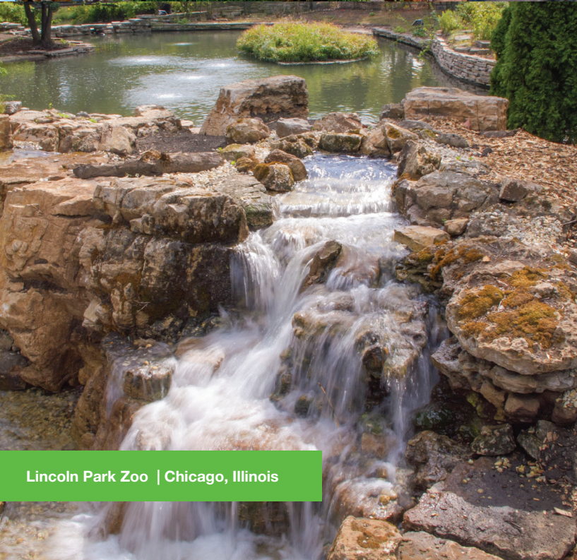
Lincoln Park Zoo | Chicago, Illinois