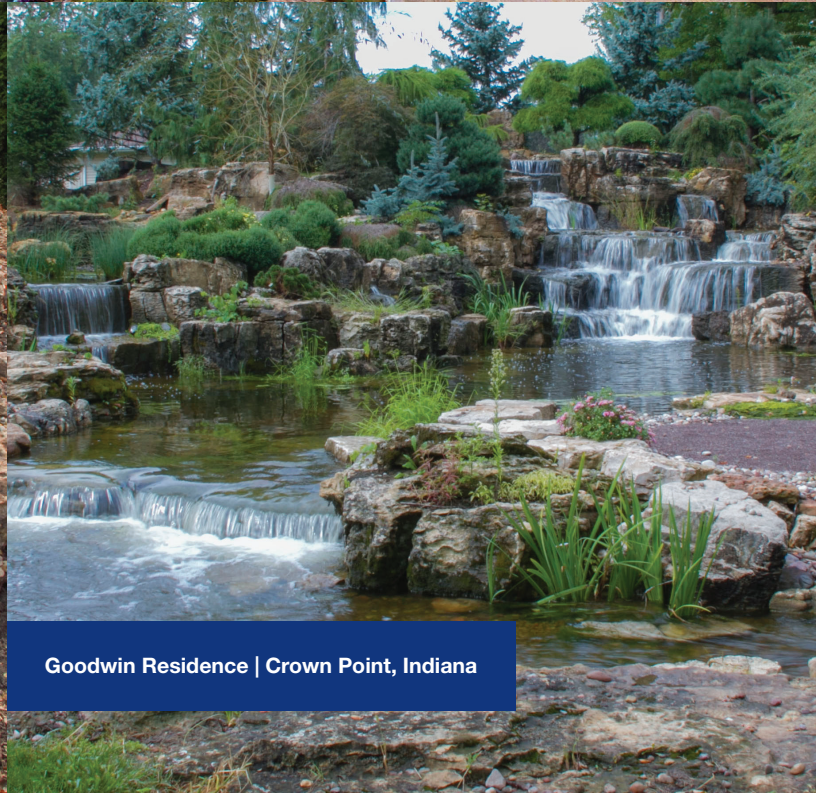
Goodwin Residence | Crown Point, Indiana